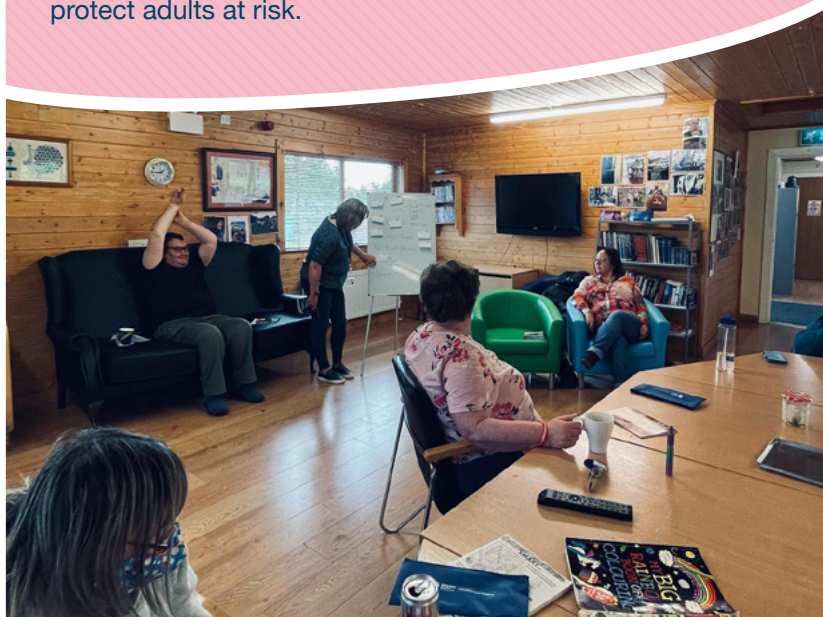
Participants and Council reps working together

Its important to remember that with the right support, most people with a learning disability in Northern Ireland can lead independent lives. To keep vulnerable adults safe we all need to ensure that organisations work together to protect adults at risk.