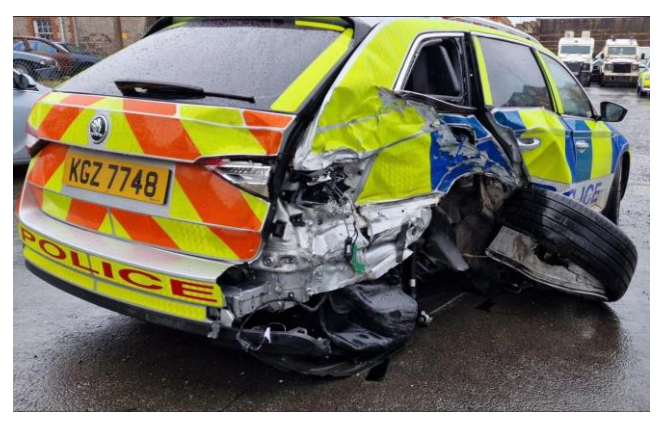
Examples of damaged Police Vehicles currently awaiting repair.