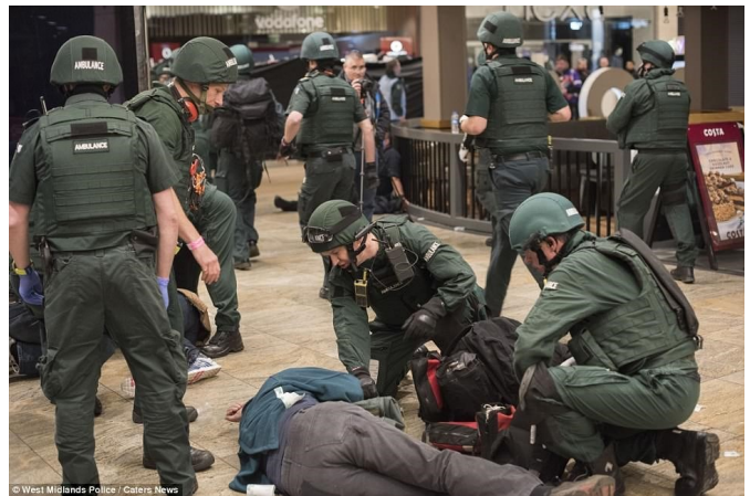
Hazardous Area Response Team (HART)

This decision addresses identified health and safety risks and ensures we have a fit for purpose uniform that aligns with national standards