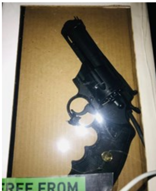
Image of a suspected firearm seized during one of the searches

Two men, aged 36 and 31, were arrested on suspicion of a number of offences, including possessing criminal property. Both have been released on Police bail pending further enquiries.