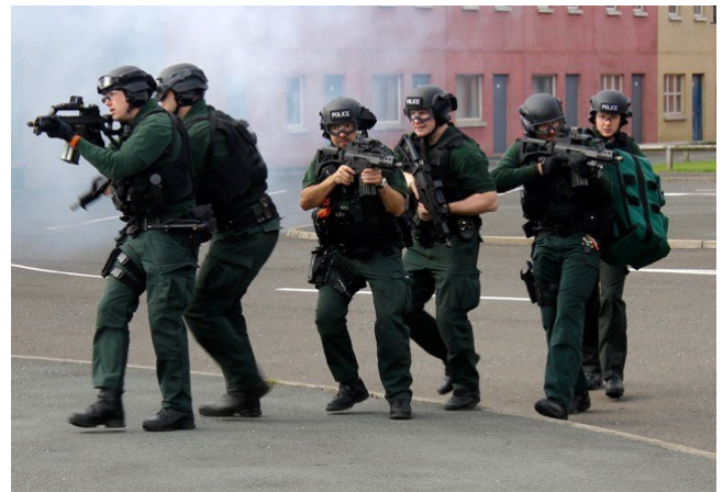
Armed Response Unit (ARU)