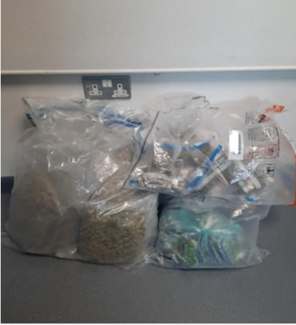
Suspected Class A and Class B controlled drugs

possession of a Class A controlled drug. Enquiries are continuing.