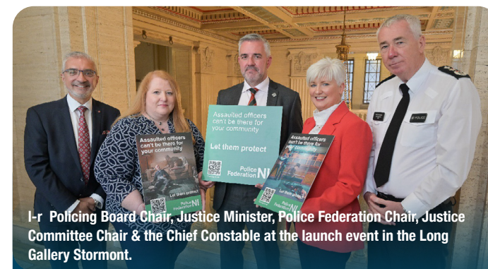
I-r Policing Board Chair, Justice Minister, Police Federation Chair, Justice Committee Chair & the Chief Constable at the launch event in the Long Gallery Stormont.

Listen to Oral questions from Board Members