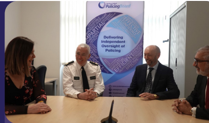
The Board's Chief Executive, Chief Constable, Chair and Vice Chair