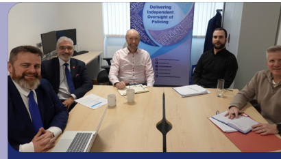
The Human Rights Advisor, Chair, Vice Chair, Engagement Manager and NI Children's Commissioner

Our Chair, Vice Chair, Independent Human Rights Advisor and Engagement Manager met with the Children's Commissioner this month to discuss key issues around children and young people, policing and police oversight.