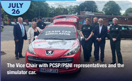
The Vice Chair with PCSP/PSNI representatives and the simulator car.