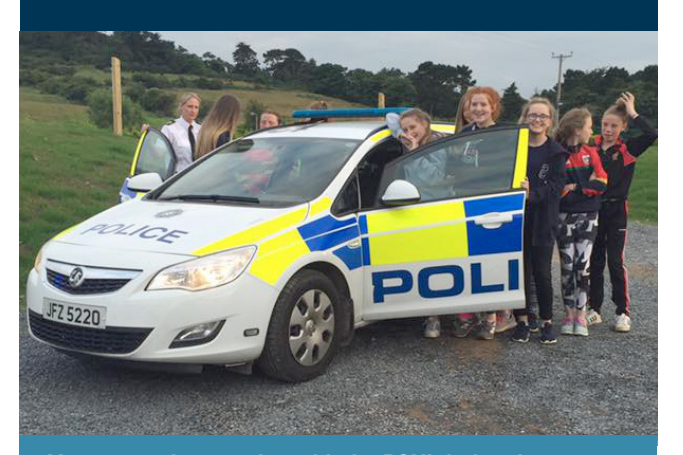
Young people engaging with the PSNI during the Programme

The initiative will continue to run throughout August every Friday night from 7pm-9pm.