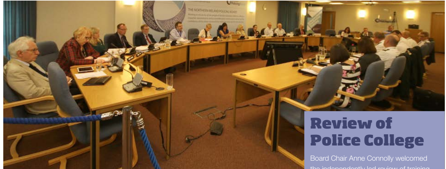
The September Board meeting in public

The Chief Constable said that the budget could be cut by around £40m in 2017/18. He said that increasing demands cannot be met under the financial arrangements and will push sick and stress levels to unmanageable levels. Despite reducing budgets, he assured Members that the PSNI will not “walk away from vulnerable people”.