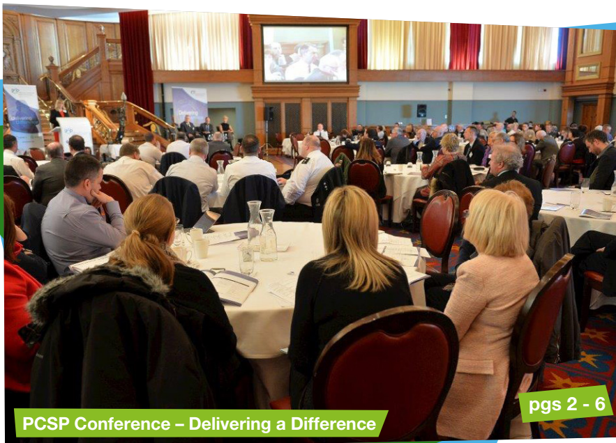
PCSP Conference – Delivering a Difference