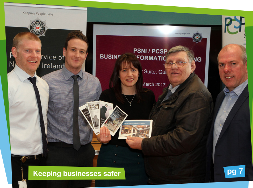
Keeping businesses safer