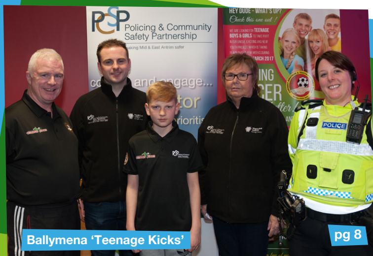
Ballymena 'Teenage Kicks'