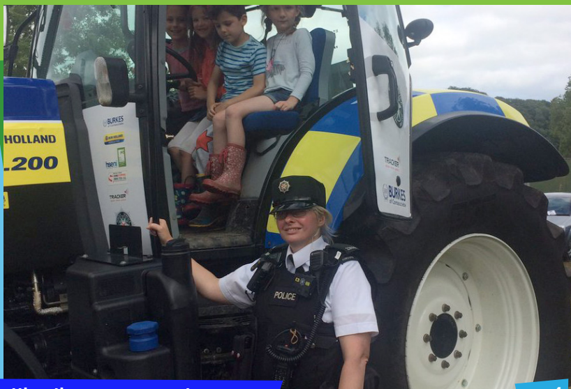
Getting the message out