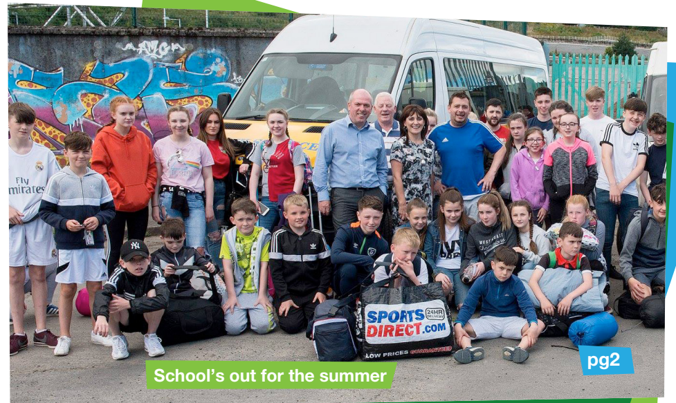
School's out for the summer