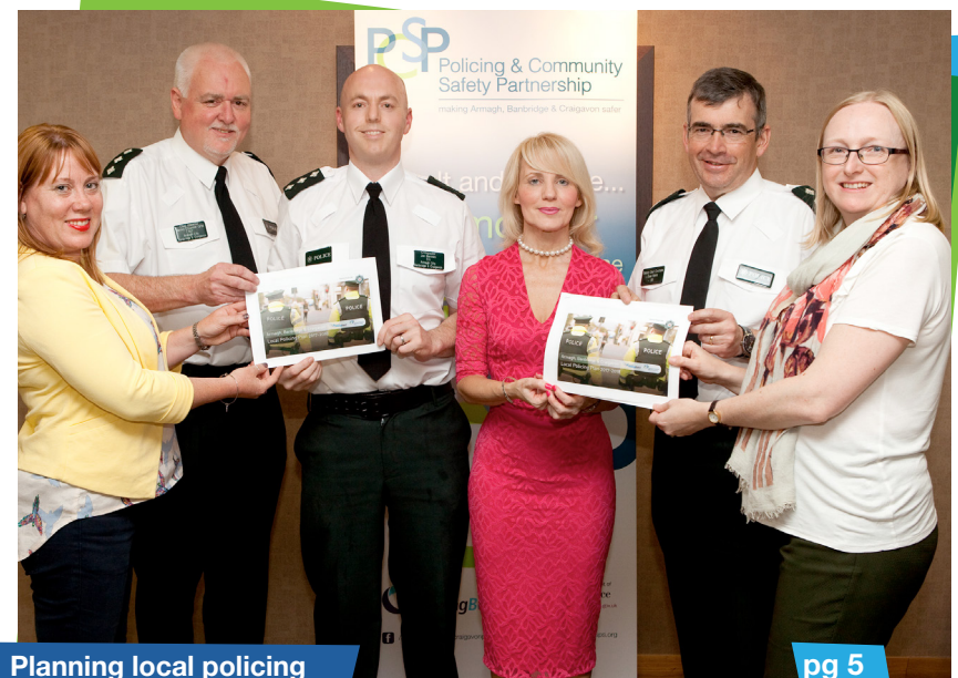
Planning local policing