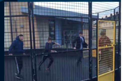
Cage soccer at CKS Community Centre

A series of football coaching sessions have been delivered by the PCSP working alongside Council leisure staff, using the cage to develop individual skills, special tricks, exhibition football and goal scoring techniques.