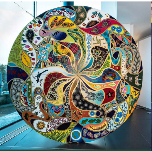
The artwork produced by the Inter Ethnic Forum and local young people.

Mid & East Antrim PCSP and the Inter Ethnic Forum have been working with young people to develop this amazing piece of artwork (right). The PCSP are committed to addressing hate crime, particularly race hate crime, and this engagement is designed to encourage young people from the area to build relations and understanding of those from ethnic minority backgrounds.