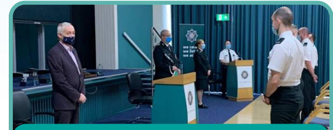
Our Board Chair joined with the Chief Constable to welcome PSNI newest officers at the November Attestation Ceremony.