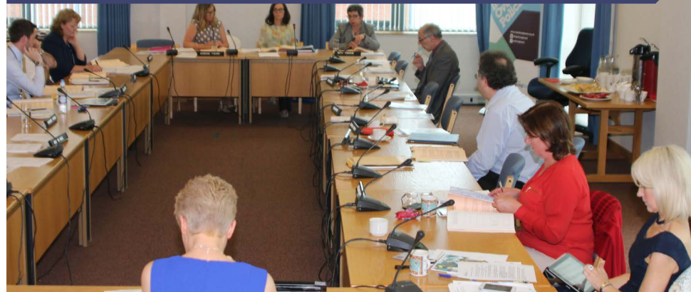
The first meeting of the Partnership Committee.