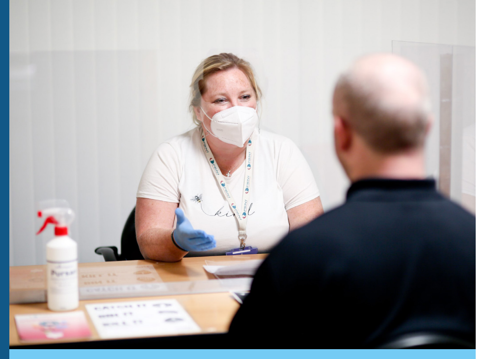
An example of COVID-style supervision

She added: "We also introduced a new screening tool, which all probation officers use to identify concerns in any case in respect of domestic violence or child protection. This tool flags up any concerns in a case at the earliest stage and enable us to put measures in to keep people safer."