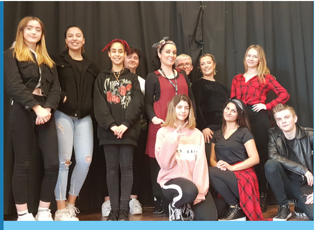
Actors from the play

Choices examines some of the issues prevalent within teen society today, like drugs misuse, mental health issues, and the dangers involved with sending nude images.