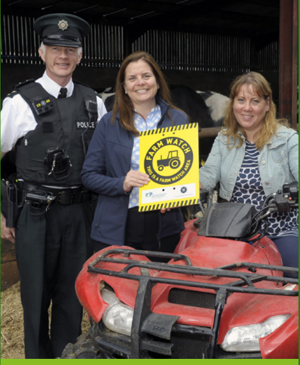
Launch of agri-crime prevention scheme, Farm Watch.