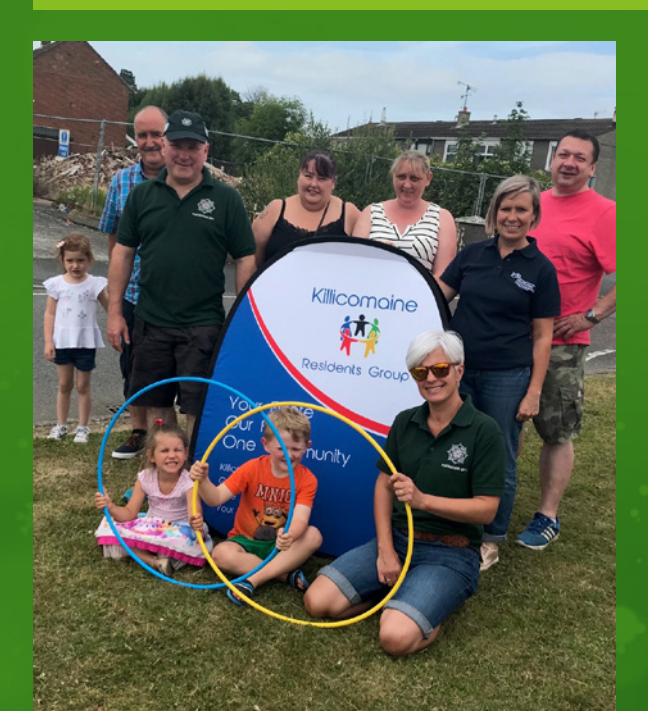
Police engage with the Killicomaine Residents at their fun day (also front cover).

Anti-social behaviour remains a big issue and was highlighted as a major concern during the consultation process for our Strategic Plan 2016-2019. Our PCSP continues to work alongside our partners to deliver locally based initiatives, especially in hotspot areas.