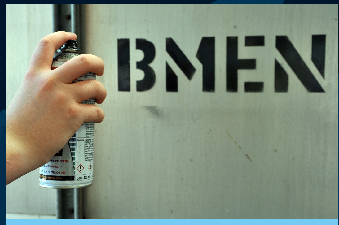
Making a mark in Ballymena.