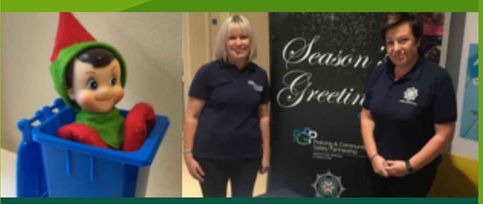
There's nowhere SherLOCK won't go to spread Christmas Safety messages