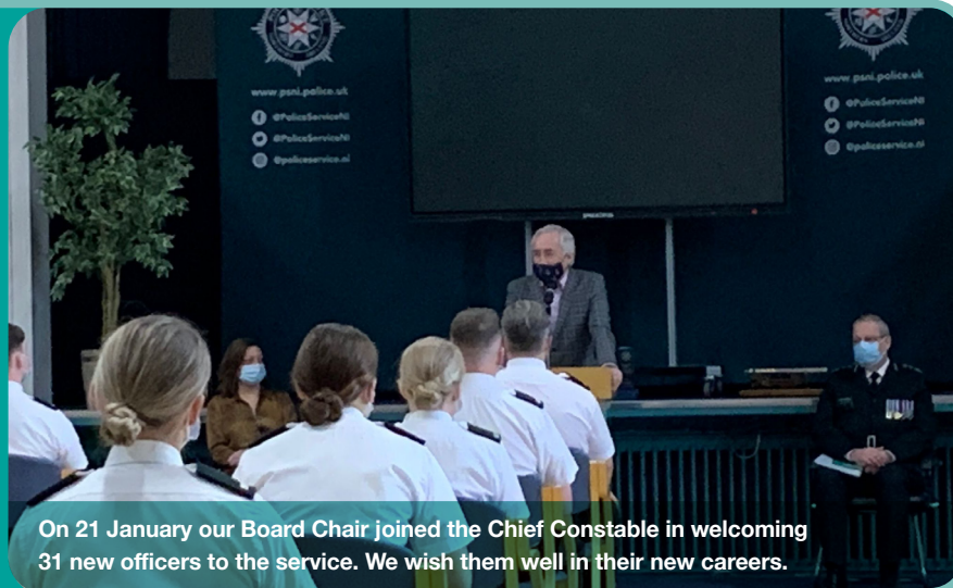
On 21 January our Board Chair joined the Chief Constable in welcoming 31 new officers to the service. We wish them well in their new careers.